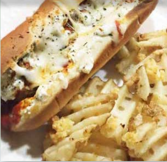
Italian meatballs in red sauce inside of a toasted hoagie and topped with provolone and mozzarella cheeses served with a side of waffle cut Idaho potato fries